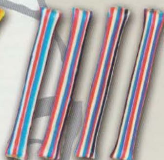
Cinnamon Jack Straws (chocolate filled)