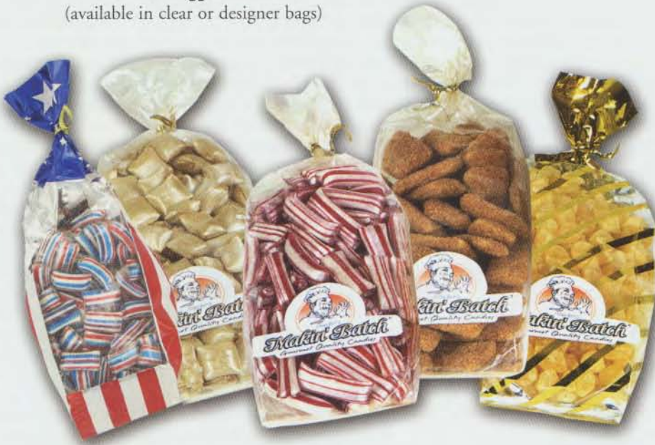
Assorted Bagged Candies (available in clear or designer bags)