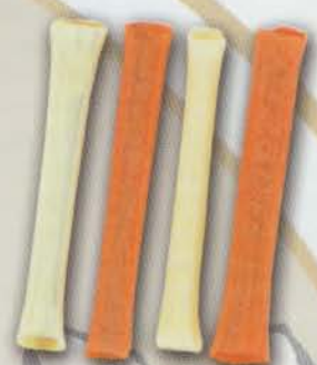
Mocha Jack Straws (chocolate filled)