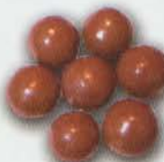
Malted Milk Ball