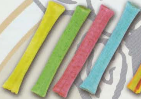
Spring Jack Straws (chocolate filled)