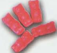
Cinnamon Ju Ju Bear