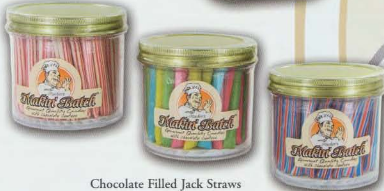
Chocolate Filled Jack Straws