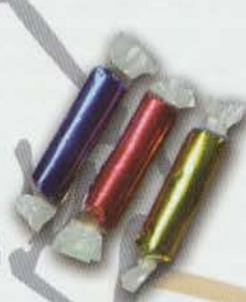
Foil Wrapped Flavor Gems