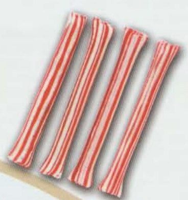
Peppermint Jack Straws (chocolate filled)