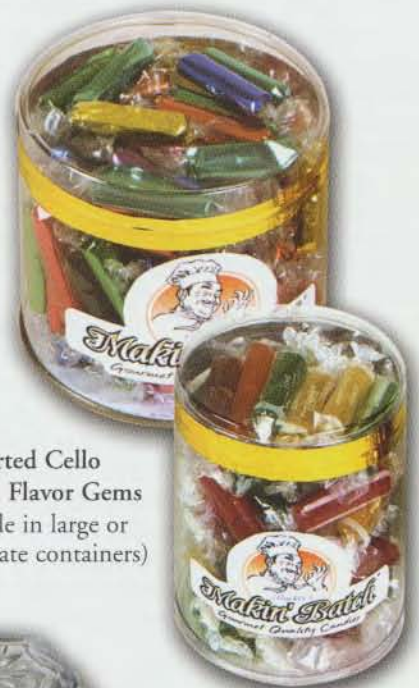
Assorted Cello Wrapped Flavor Gems (available in large or small acetate containers)