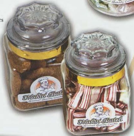
Small Glass Apothecary Jars