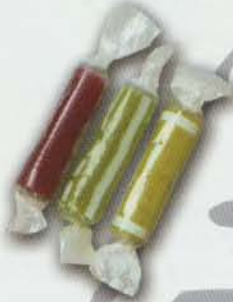
Cello Wrapped Flavor Gems