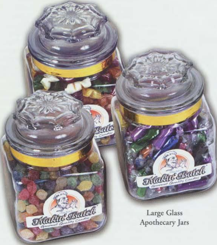
Large Glass Apothecary Jars