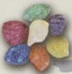
Midget Fruit Balls