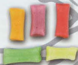
Midget Fruit Straws (chocolate filled)