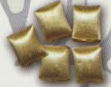
Peanut Butter Pillows