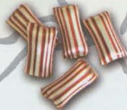
Midget Peppermint Straws (chocolate filled)