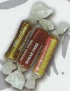
Sugar Free Cello Wrapped Flavor Gems