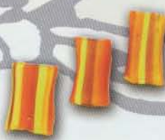
Midget Banana Straws (chocolate filled)