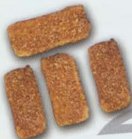
Peanut Butter Logs